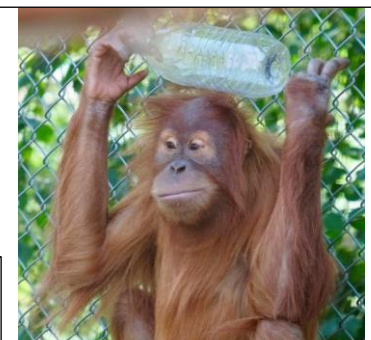
Can't even get a drink of WATER when you need one...

<<< AUGUST 2022 .... was ... very HOT everywhere, grass and crops in fields were all brown and dried up, hosepipe bans in force with wild-fires burning everywhere & all our beaches crowded... whew!