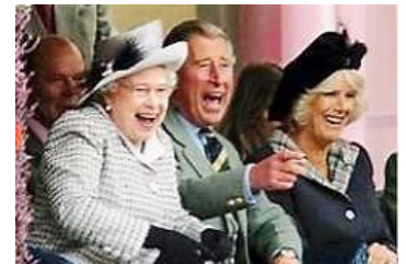
What a lovely picture of The Queen and family in happier times