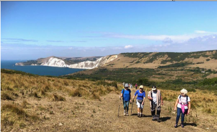
Dorset Worbarrow Bay & Tyneham Village

Live ammunition is still used here in training troops, and only open to the public on certain days.