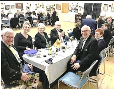
<< Our guests from The Cornish Society