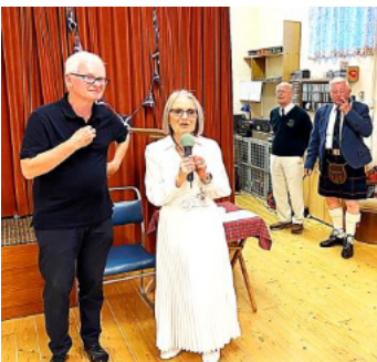
A lovely evening with dancing and fun for all with really nice "eats" and drinks as well