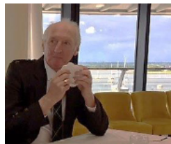
From the guest room in the RNLI one gets a great view over the Harbour.