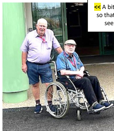
<< A bit larger >> so that you can see them

.... Below in Glen Coe.. ....not safe for Campbells to go there !