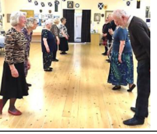
Winners of the Spot Waltz. >>>>>